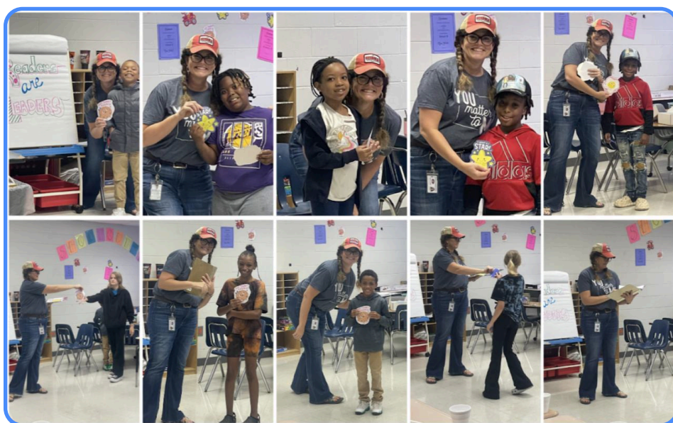
Image: Pancake Party